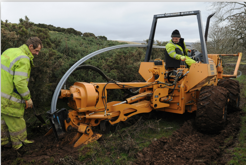
Fiber installation.

Wilson, North Carolina built the Greenlight network in 2008. Two private Internet Service Providers had refused to improve their unreliable services, and the city was looking to strengthen the local economy after the loss of key industries. Wilson used Certificates of Participation, which are similar to revenue bonds, to fund building the network. They now have a network that connects every home and business in the city and provides some of the fastest connections in the country. Greenlight has helped Wilson become an important source of economic growth in the region, with new businesses, including a film production company's special effects studio, coming into town to take advantage of the network.