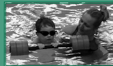
Swim lessons are offered for all ages at the Costick Center pool.

Receive text notifications for pool closures and class cancellations. Pool staff members have handouts with directions on how to register.