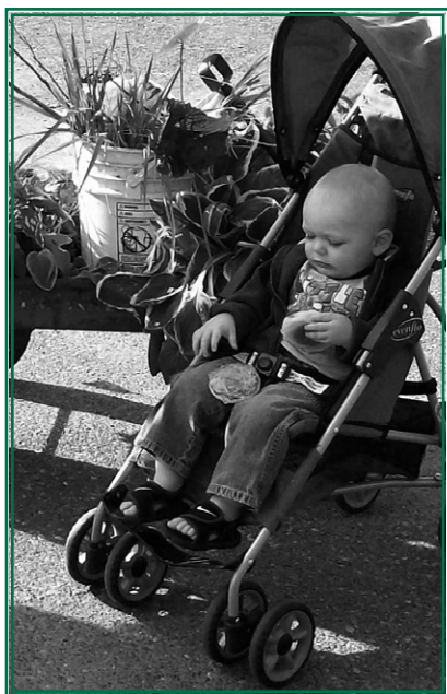
A young plant enthusiast enjoys the Spring Plant Swap