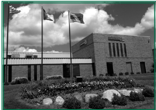
The Beautification Commission presented the Beautification Commissioners' Award to Corrosion Fluid Products, located on Indoplex Circle, in recognition of the site's colorful planting and maintenance.

The Beautification Commission presents annual awards to businesses, offices, and subdivision or condominium entrances with attractive and well-maintained landscapes. Judges visit nominated sites to look for landscape variety, imaginative use of color, and overall property maintenance. If you would like to nominate your property or any other deserving property, nomination forms are available after May 9 at www.fhgov.com or call the Community Development Office at 248-871-2543 to have a form faxed or mailed. Judging takes place during the month of July. Awards will be presented at the 2014 Beautification Commission Awards Ceremony in late fall.