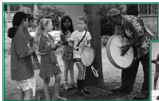
The Cultural Arts Division offers a diverse range of music, art and theater classes year round.

Public Skating: Skating times are offered just about every day of the week for all ages. Visit fhice.com or call 248-478-8800 for the monthly public skating schedule or for program information.