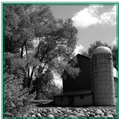
The historic barn at Heritage Park

The City is offering help to qualified homeowners who plan to winterize their houses. Zero Interest Winterization Loans may be used for home improvement projects such as adding insulation or replacing windows, roofs or furnaces. Funding for this program is provided by the U.S. Housing and Urban Development Office through the Community Development Block Grant. To qualify for the loans, applicants must have owned and occupied a home in Farmington Hills for at least one year. The family must also meet Federal income guidelines, for example, a family of four must have a gross income of less than $56,800. Income guidelines, applications, and program details are available at www.fhgov.com . Click on Quick Links and choose Housing Rehabilitation Program or call the Community Development Office at 248-871-2543.