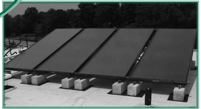
A solar hot water heating system provides hot water using thermal energy from the sun rather than natural gas. Even on cloudy days, 120 degree water temperatures have been achieved without using additional electricity.

After years of planning, hard work, and some inconvenience, City Hall will be re-dedicated on November 17 at 5pm. Please join us to celebrate this momentous occasion. The event will showcase various sustainable building practices used to make City Hall eligible for LEED Certification at the Gold Level. Details on the re-dedication will be announced when they are finalized.