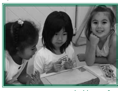
Art Adventure Camp

The City Gallery in the Costick Center Lobby hosts a variety of exhibits throughout the year featuring talented artists, designers and group exhibits. To see the full schedule of exhibits, go to the art exhibit page at Community/Cultural Arts at www.fhgov.com .