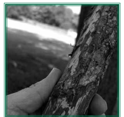
A branch from a Black Walnut tree with Thousand Cankers Disease

The Planning and Community Development Department stays aware of woodland threats through contacts with State and Federal agencies. For more information on Black Walnut Thousand Cankers Disease go to the Michigan Department of Natural Resources website www.michigan.gov/dnr (search for Black Walnut) or the U.S. Department of Agriculture, Forest Service Pest Alert at http://na.fs.fed.us/pubs . (Click on Public Alerts and choose Thousand Cankers.)