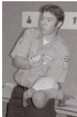
Learning how to help a choking victim is just one of the demonstrations that will be offered at the first-aid program in March.

The program is sponsored by the Farmington Hills Citizen Corps Council for Emergency Preparedness (CCCEP), with support from Botsford General Hospital, Community EMS, the Farmington Area Commission on Aging, Farmington Hills Fire Department, Farmington Hills Police Department, and the Farmington Public Safety Department. Pfizer Corp. has also generously offered to help underwrite the program.